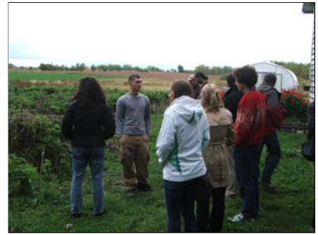
As part of the group tours on Saturday, one of the St. Olaf 'farmers' (gray shirt, middle) shows participants around the STOGROW farm.