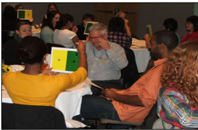
Participants conduct vision experiments as part of Friday evening's presentation from several students in the Neuroscience program.