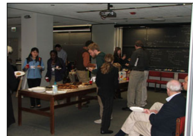
Breakfast at the Kersten Physics Teaching Center at The University of Chicago.