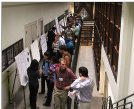
Students and faculty discuss poster presentations on Saturday evening.