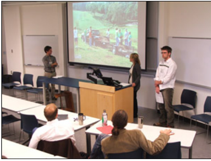
Students from Augustana describe their student-organized garden and farm projects.