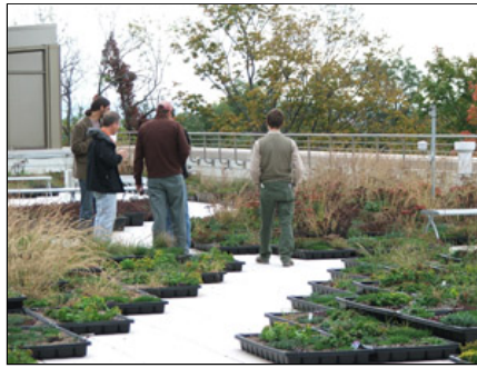
Participants explore St. Olaf's green roof which is a fully accessible top floor patio covered by large, flat containers of grasses, groundcovers and other native plants.