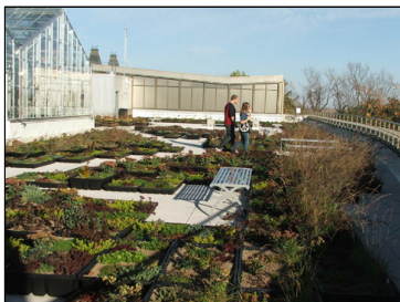
The green roof and greenhouse on top of Regents Hall.