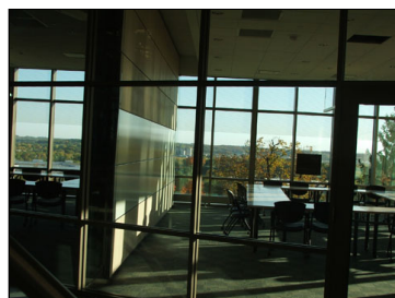
Two beautiful glass meeting rooms.