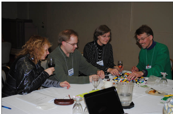
One group works to create their vision of the ideal environment for midcareer faculty members using Legos. The results were fun, creative and whimsical.