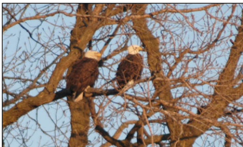
A mating pair of bald eagles sat high in a tree above the river.